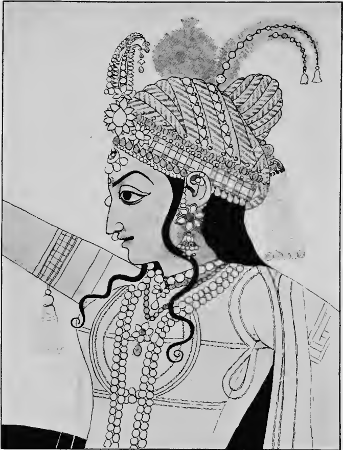
THE HEAD OF DANCING KRISHNA