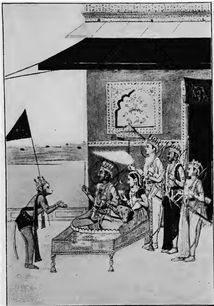
RAMA AND SITA ENTHRONED ATTENDED BY RAMA'S THREE BROTHERS AND THE FAITHFUL HANUMAN RECEIVING HIS ORDERS

From an Oriental Painting in the British Museum