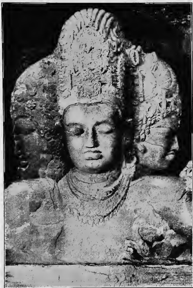
TRIMŪRTI SCULPTURE, ELEPHANTA