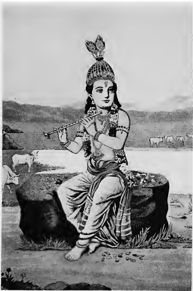
KRISHNA PLAYING HIS PIPE