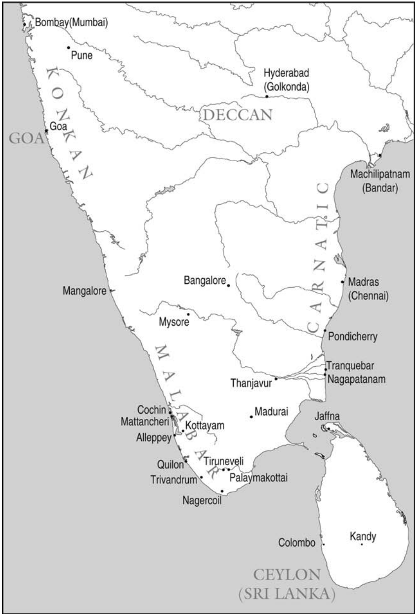
Map 4. Southern India (c.1750–1857)