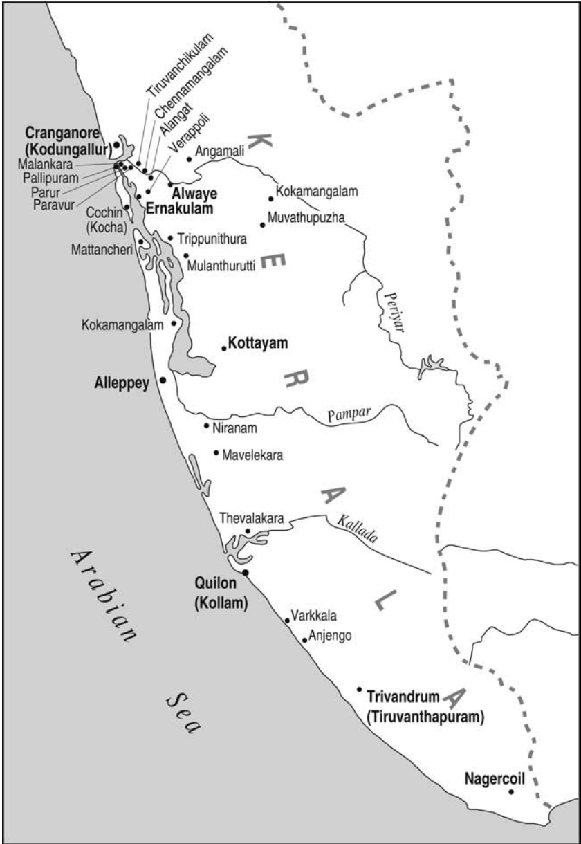
Map 2. Malabar coast and mountain hinterland