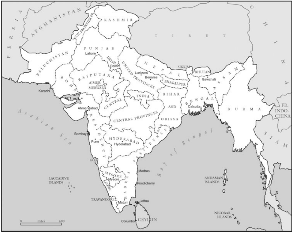
Map 6. The Indian Empire (c.1858-1947)