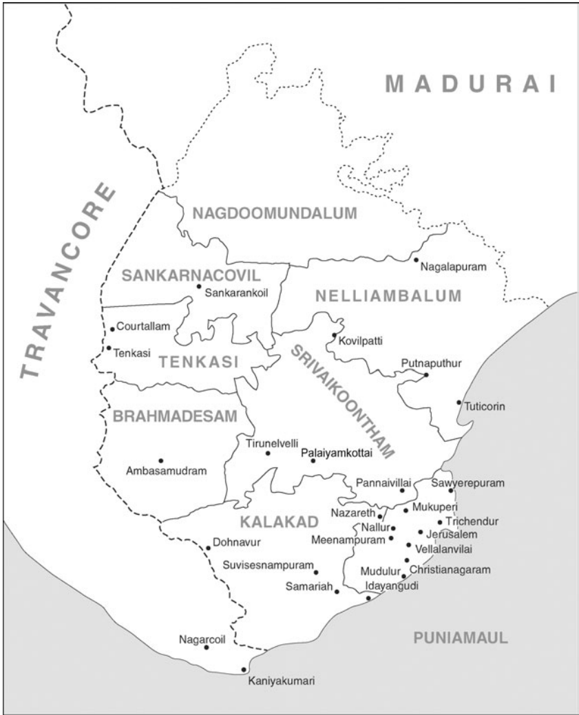
Map 5. Tirunelveli country (c.1770–1900)