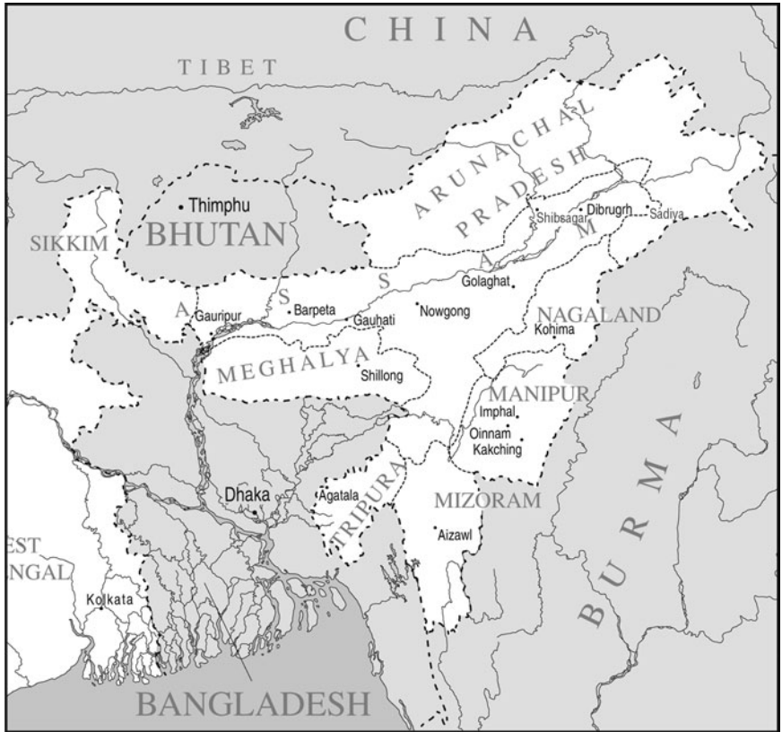
Map 8. North-eastern India