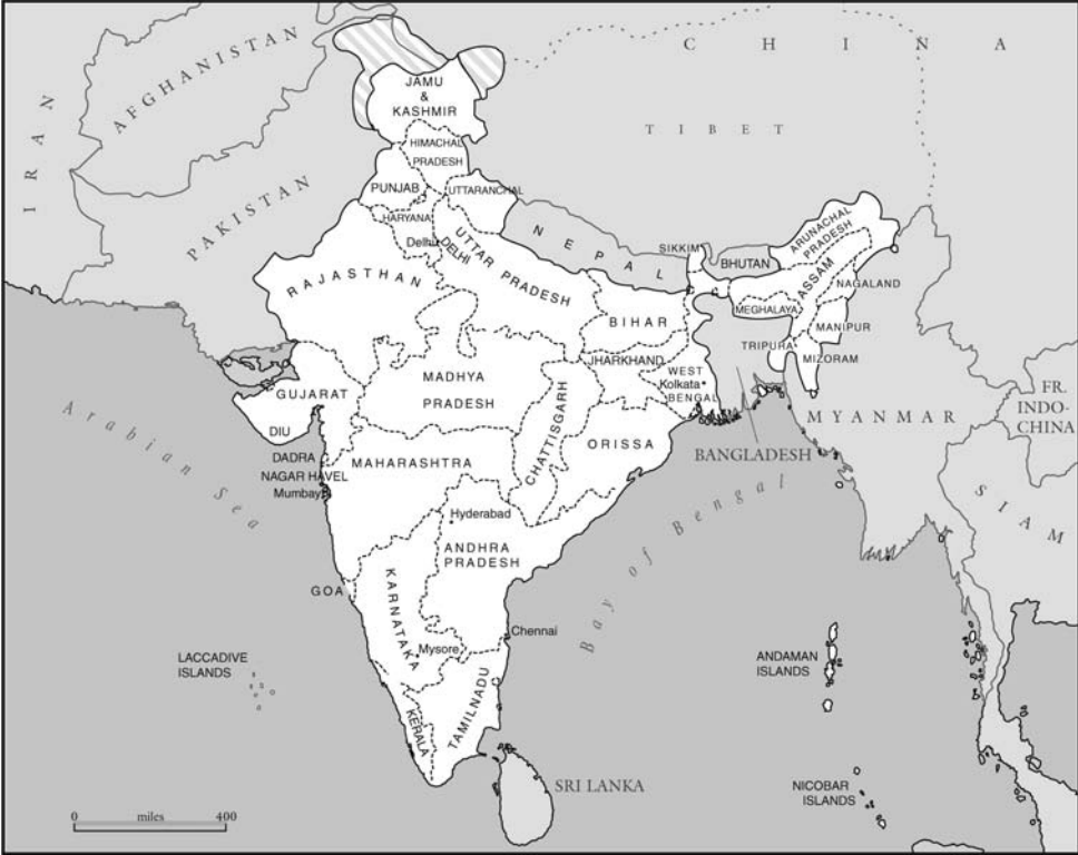
Map 7. Contemporary India (c.1947-2008)