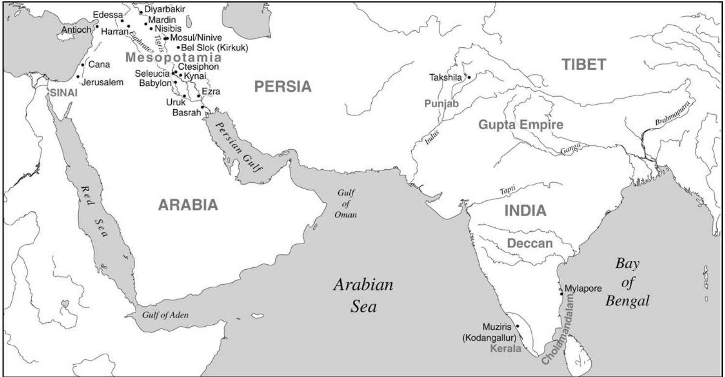
Map 1. Ancient Near East and Indian continent