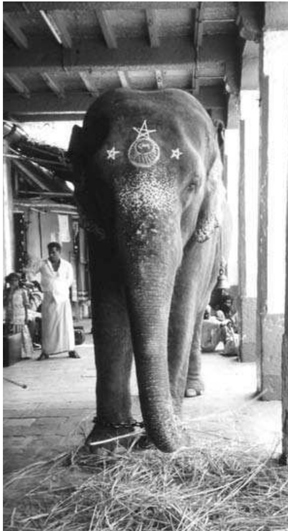
FIGURE 13 Fatimah, the shrine elephant—after the fashion of Hindu temple elephants, but with Islamic insignia—Nagore, Tamil Nadu.