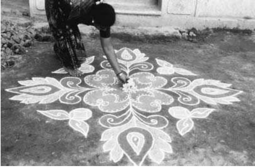
FIGURE 2 Adorning a kolam diagram, Madurai, Tamil Nadu.

Mariamman every day in his household shrine, on Tuesdays he chooses to go to the temple. Usually he goes alone, although sometimes he is accompanied by other family members.