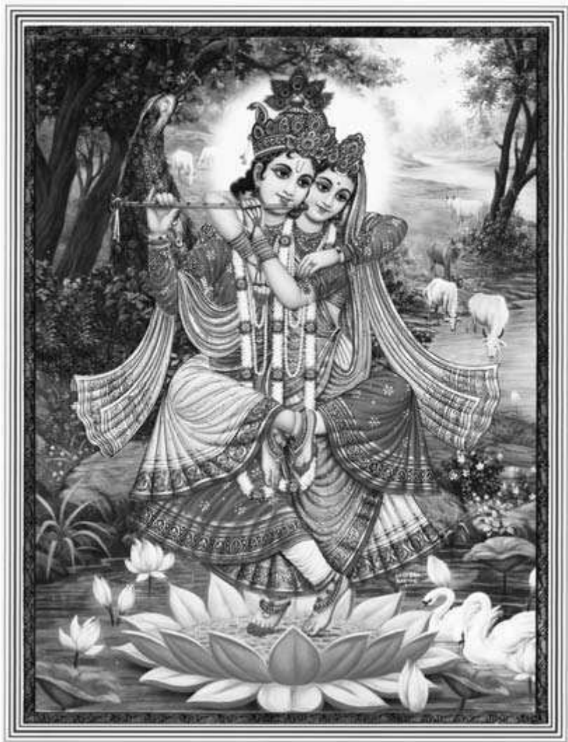
FIGURE 4 “One Soul, Two Bodies.” Poster illustration by Yogendra Rastogi, purchased in Brindavan, August 2005.