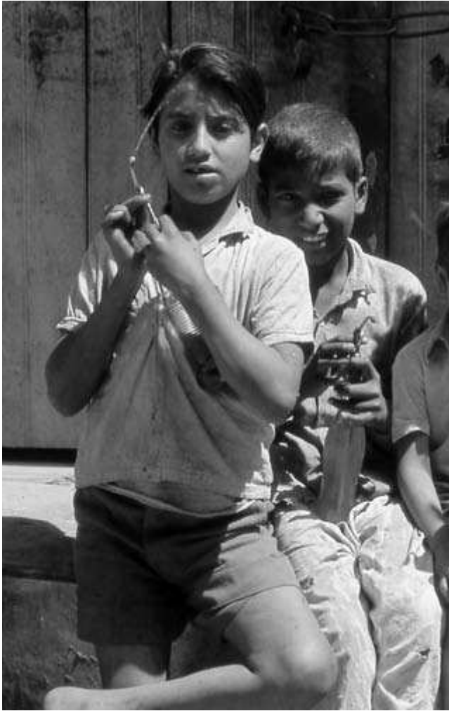
FIGURE 7 Squirting colored water at passersby as Holi approaches in Brindavan.

crumpled pages of my notebooks are blank, save for a few declining diagonals and undulating scrawls. Certain steamy scenes remain in memory, nevertheless. There was one great throng of villagers watching an uplifted male dancer with padded crotch writhe in solitary states of fevered passion and then onanism, then join in a remote pas de deux with a veiled female impersonator in a parody of pederasty, and