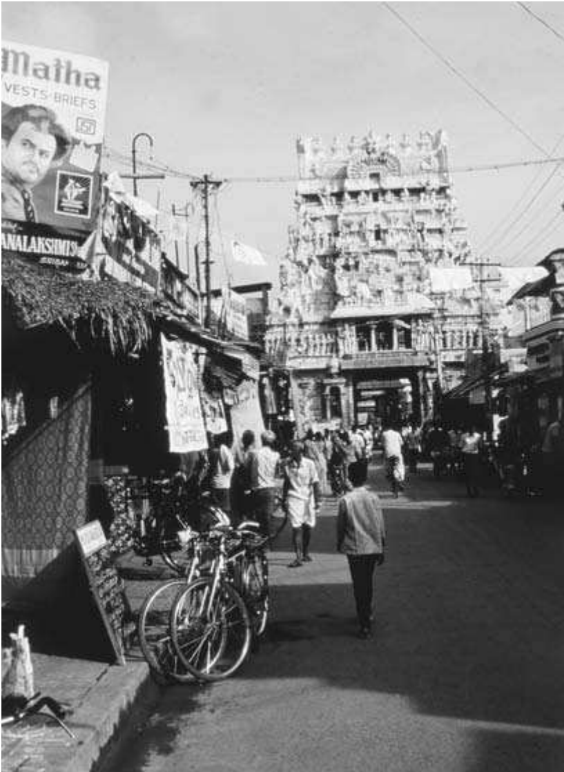
FIGURE 3 On the way to temple, Srirangam, Tamil Nadu.