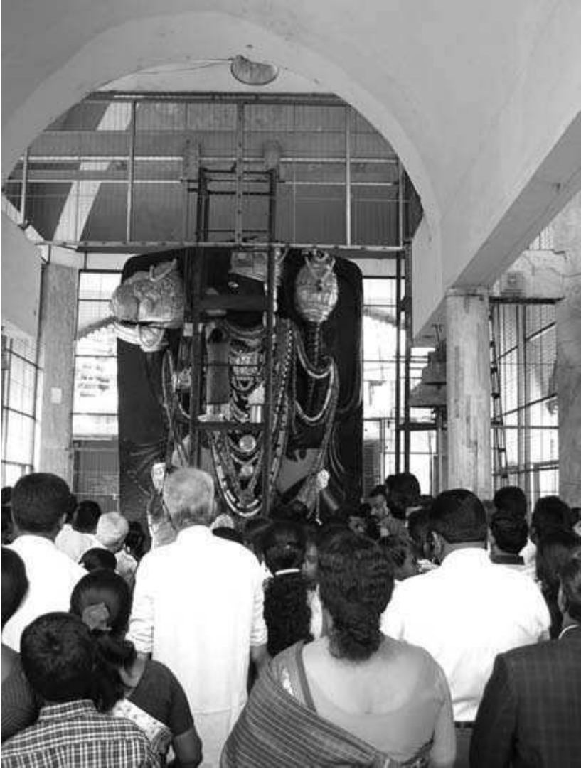
FIGURE 1 Hanuman receiving New Year's garlands, Mahalakshmiपुरam, Bangalore, January 1, 2004.