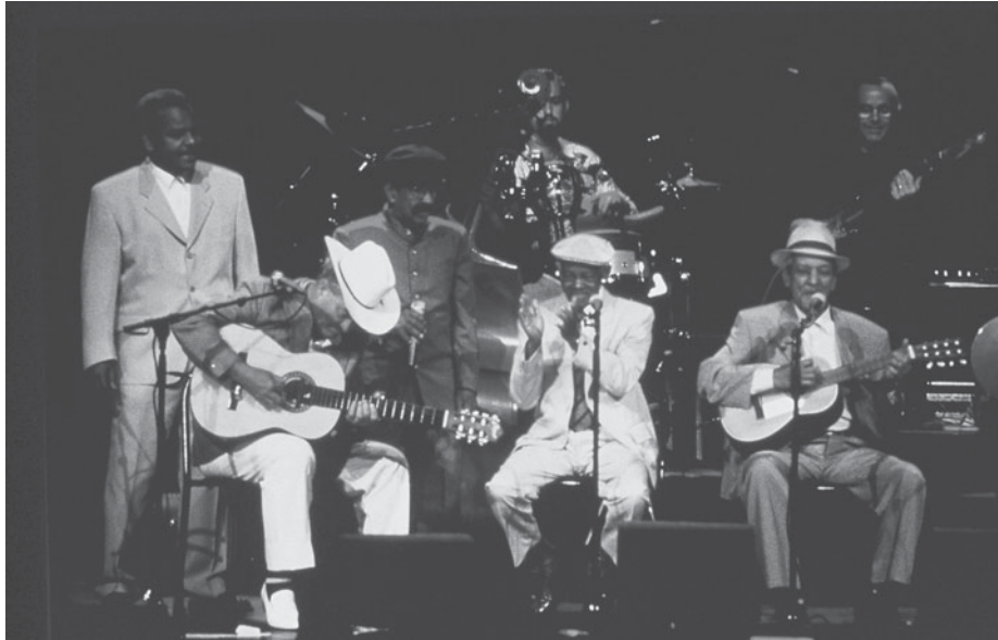
12. The Buena Vista Social Club