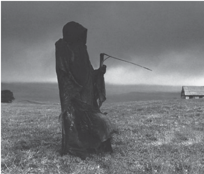
10. The Grim Reaper: a still from Monty Python's 'The Meaning of Life'

Freud set out by believing that the meaning of life was desire, or the ruses of the unconscious in our waking lives, and came to believe that the meaning of life was death. But this claim can have several different meanings. For Freud himself, it means that we are all ultimately in thrall to Thanatos , or the death drive. But it can also mean that a life which contains nothing for which one is not prepared to die is unlikely to be very fruitful. Or it can suggest that to live in an awareness of our mortality is to live with realism, irony, truthfulness, and a chastening sense of our finitude and fragility. In this respect at least, to keep faith with what is most animal about us is to live authentically. We would be less inclined to launch hubristic projects which bring ourselves and others to grief. An unconscious trust in our own immortality lies at the source of much of our destructiveness.