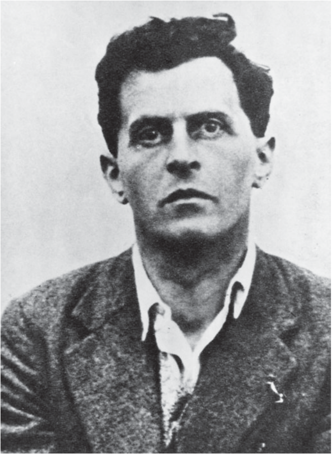
1. Ludwig Wittgenstein, commonly thought to be the greatest philosopher of the twentieth century