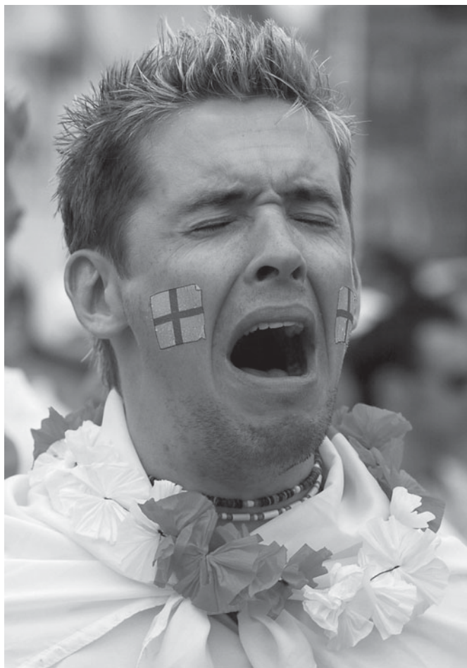
4. The agony and the ecstasy: a sports fan