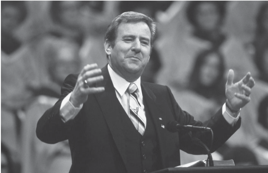
3. American TV evangelist Jerry Falwell in full fundamentalist flight