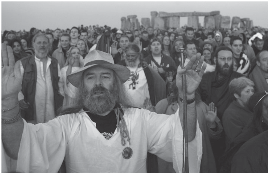
2. A 'New Age' gathering at Stonehenge