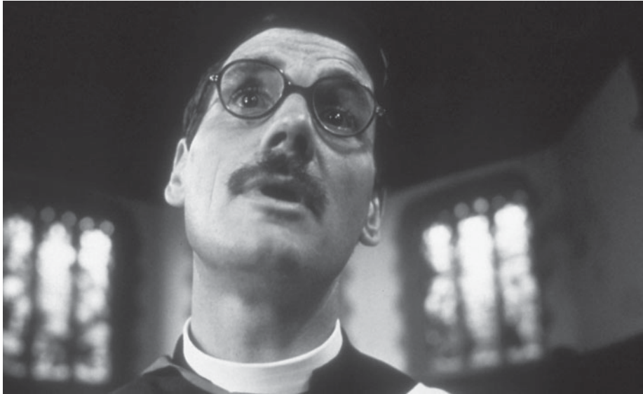
5. Michael Palin as an unctuous Anglican vicar in the Monty Python film, 'The Meaning of Life'.