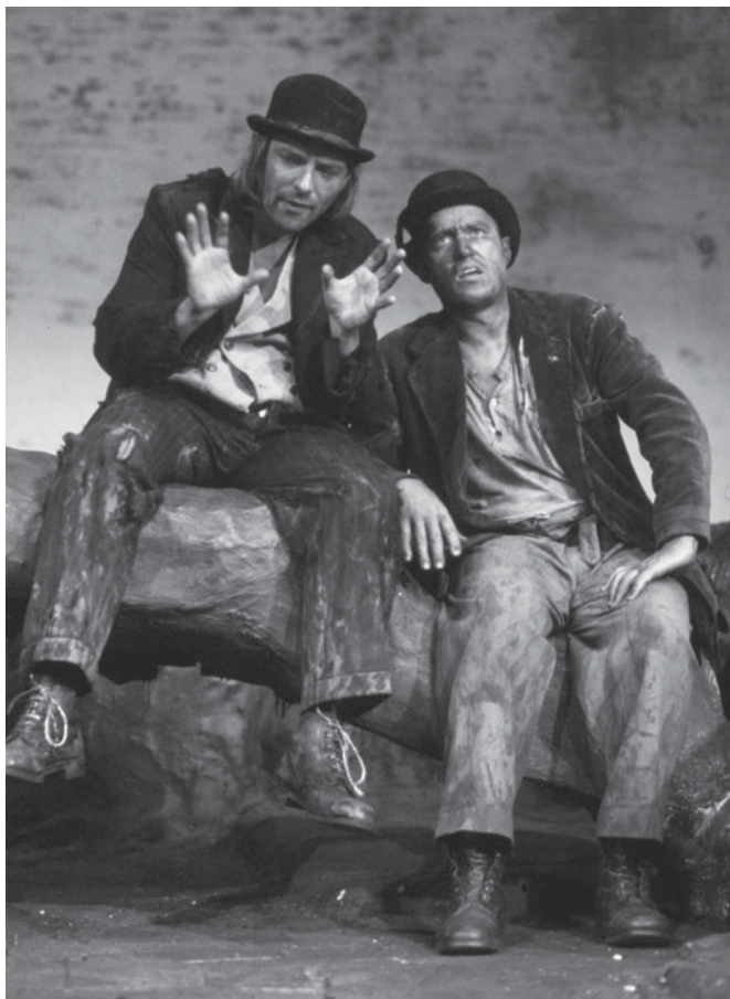
8. Vladimir and Estragon from Samuel Beckett's play Waiting for Godot