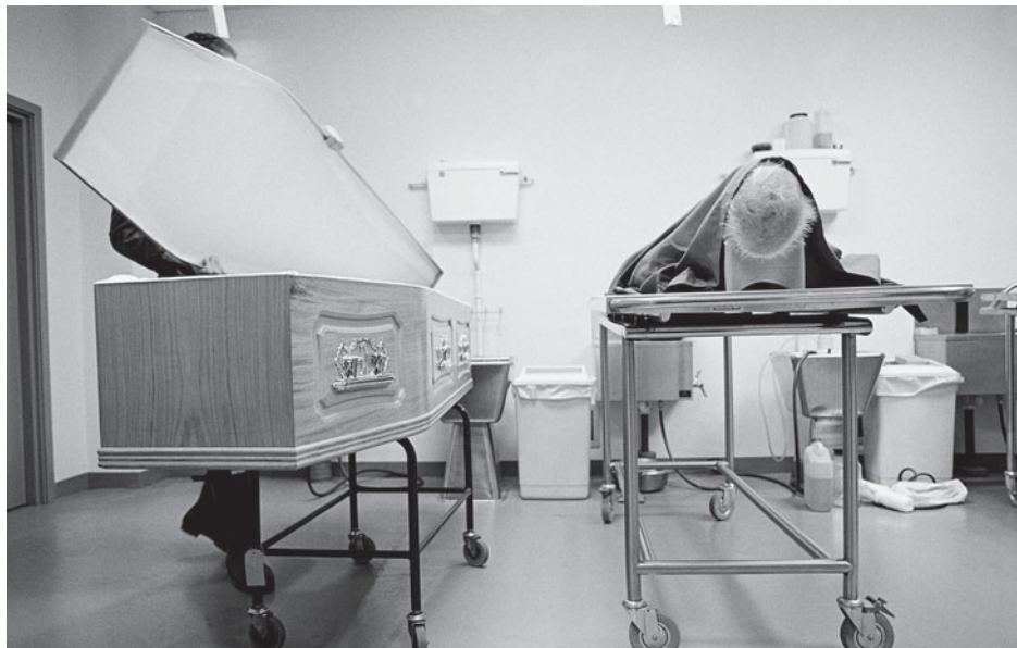
11. From here to eternity